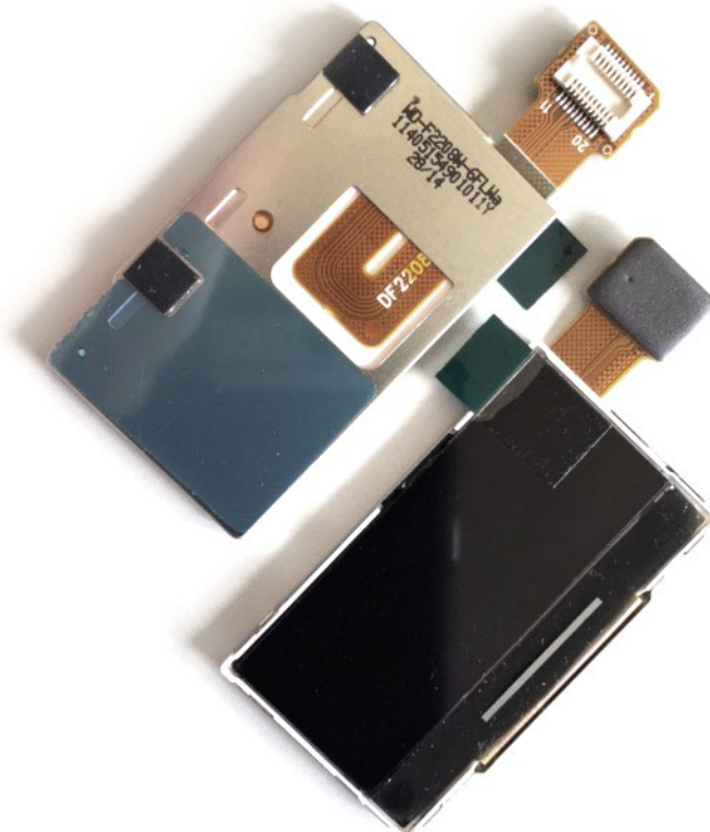
Customized TFT LCD modules